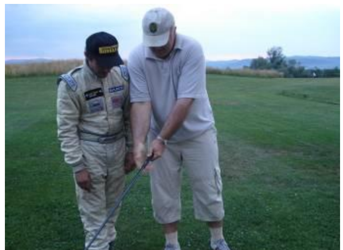
A lesson in golf