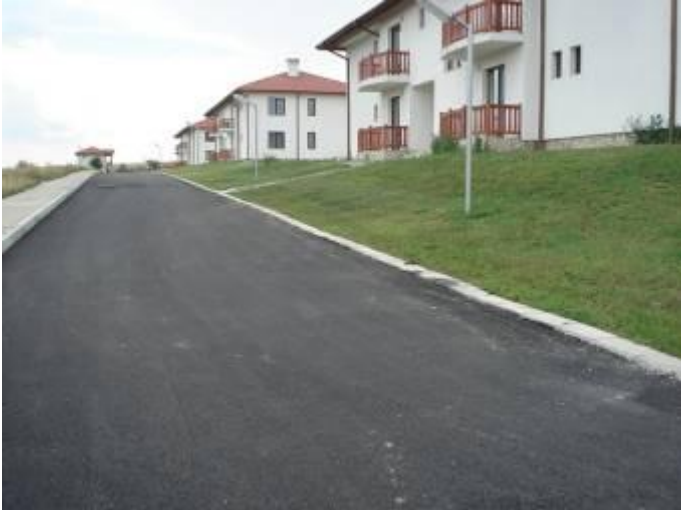
Road between blocks 1 and 5

We have completed the work on some of the roads in Stage 1, including tiding, preparation of shafts, levelling, tarmacing, and asphaltting.