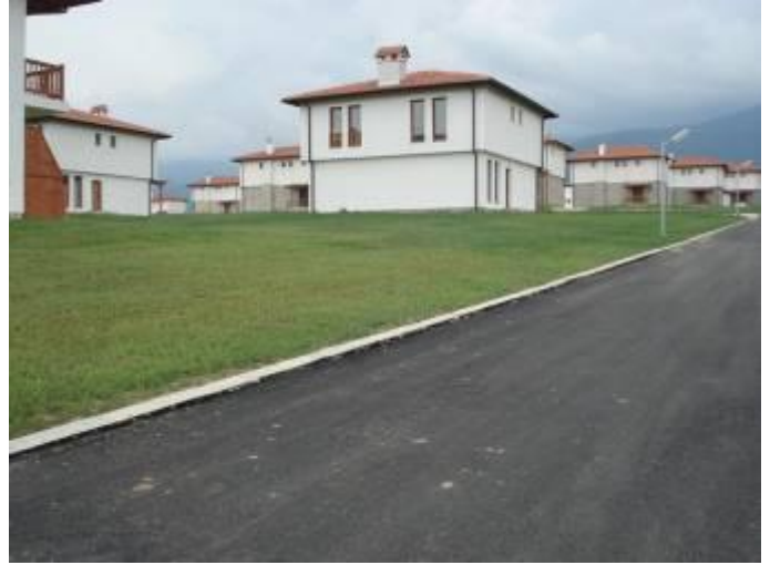
Road to the west of block 5