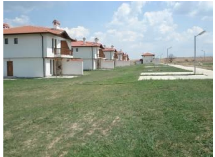
Block 5 - Maria villas