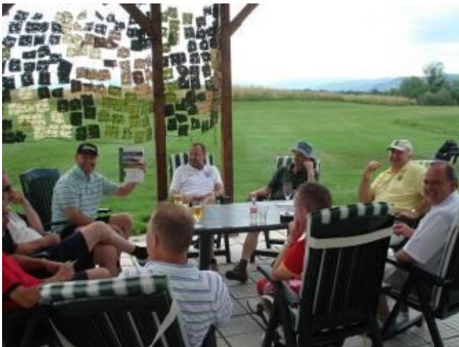
Drinks before a round of golf

On July 9 th a group of enthusiastic golfers played a round of 9 holes (holes 1 through 8 and hole 16). They really enjoyed their game and the sunny and warm weather.