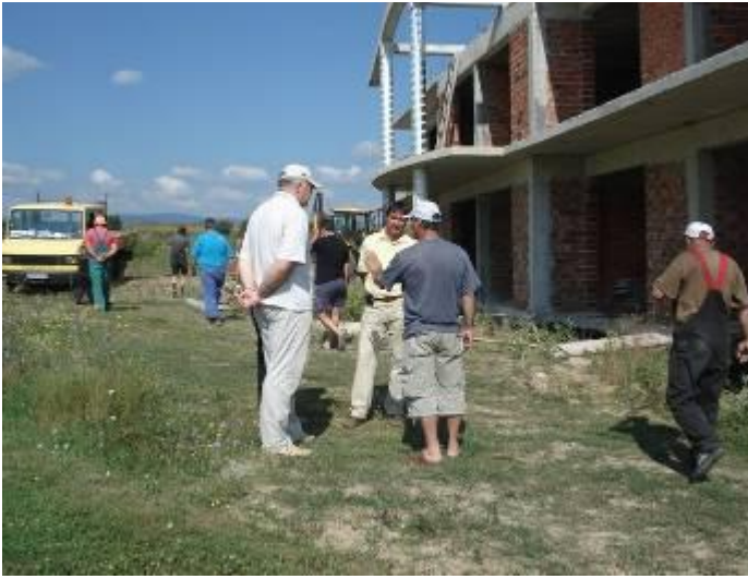
Discussion before the work begins