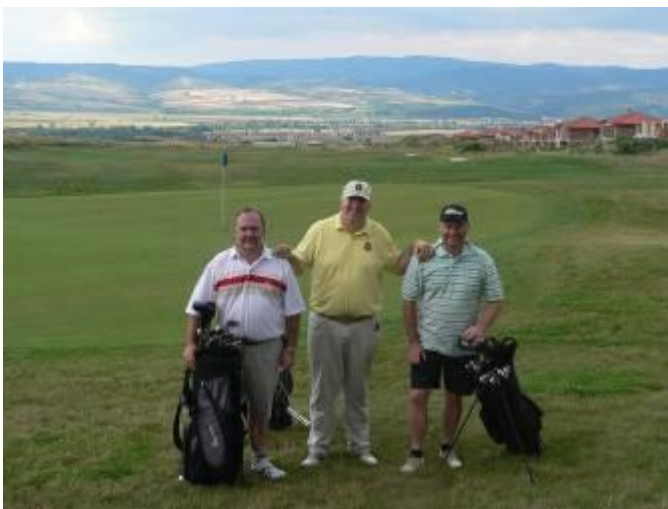
Team 1 at green hole 6