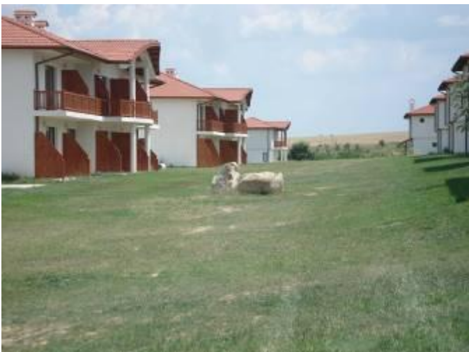
Block 5 – Ephrosina villas