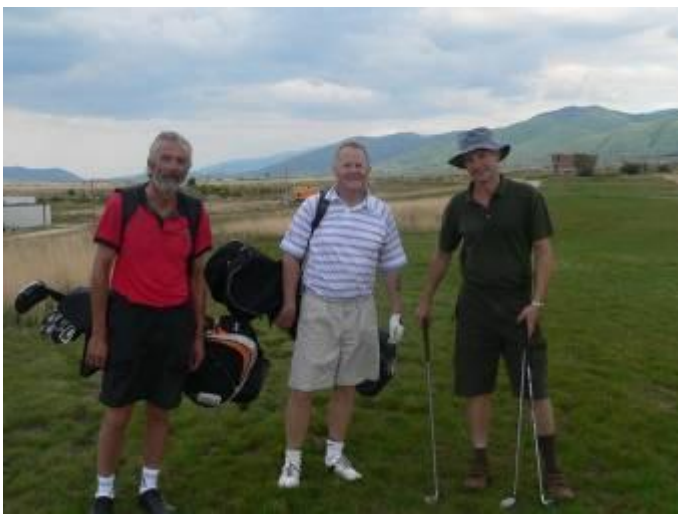
Team 3 at fairway hole 4