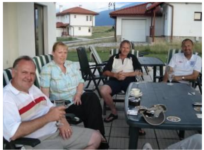
Drinks after the game