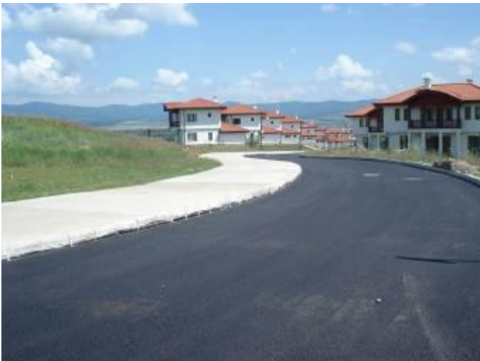
St. Andrew's Drive