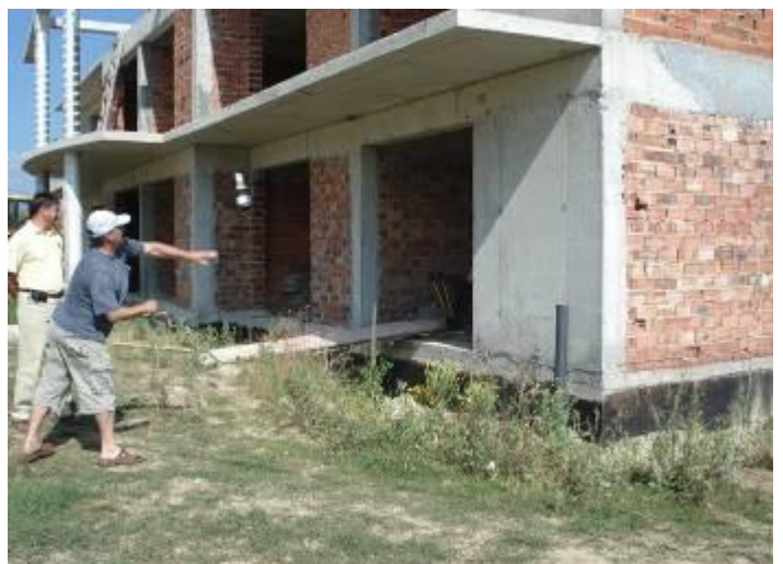
A flying bottle of Champagne