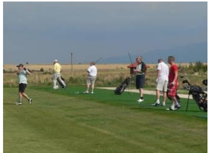
At the driving range