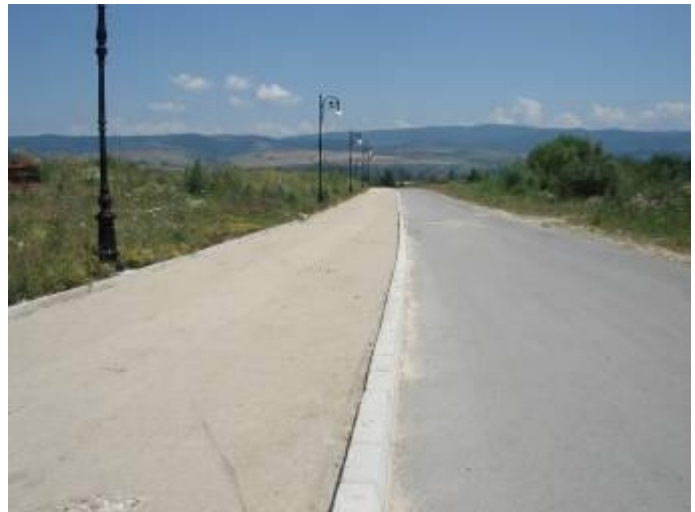
Sidewalk to Ibar