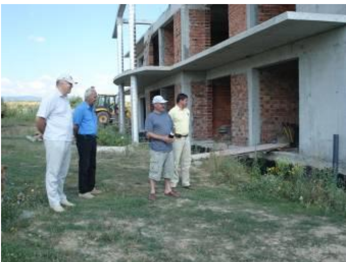
Before breaking the bottle of Champagne

We are happy to inform you that the breaking of a bottle of champagne marked the restart after a long winter break of the construction work on villa Ephrosina situated on St. Andrew's Drive 14 in Stage 1.